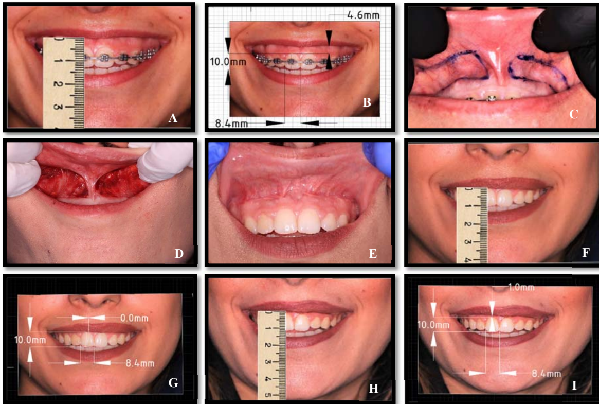
Figure 1: 20 years old ,with 4.6 mm of GD at full smiling, treated by modified lip reposition surgery and the steps includes : A , measurement of GD by millimeter ruler. B , measurement of GD by using a computer program (Autodesk, AutoCAD Civil 3D 2018) GD= 4.6 mm. C , Borders of the surgical area to be excised were demarcated with the preservation of midline frenum. D , Removal of the outlined mucosa exposing the underlining connective tissue. E , 1 month after suture removal and healed the surgical area. F , 1 month after surgical procedure GD measured by millimeter ruler. G , 1 month after surgical procedure GD measured by (Autodesk, AutoCAD ) GD = 0.0 mm. H , 4 months after surgical procedure GD measured by millimeter ruler. I , 4 months after surgical procedure GD measured by (Autodesk, AutoCAD ) GD = 1.0 mm.

mL insulin as shown in Figure 2. The patient was instructed to avoid laser/IPL treatments, facials and facial massage for one to two weeks after injections to minimize toxins dislodging and traveling to the surrounding muscles and instructed to not use aspirin, ibuprofen or naproxen (18) . The patient was re-evaluated after 1 month and 4 months of treatment.